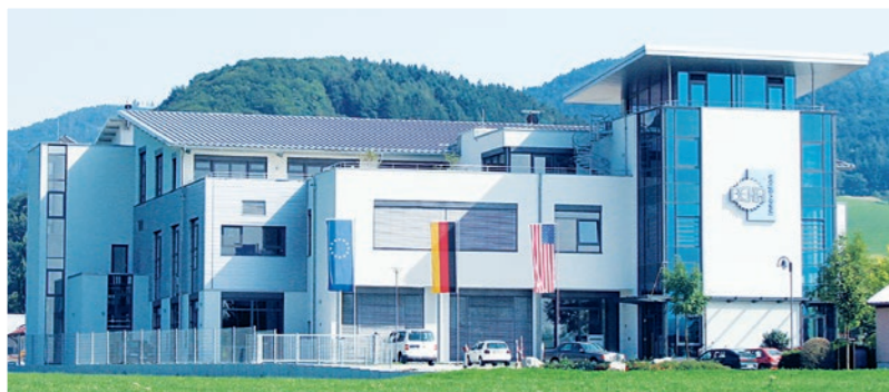
Headquarters in Glottertal / Germany